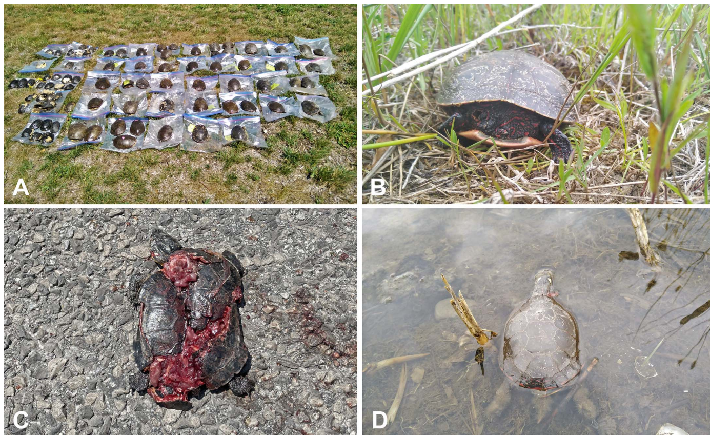
Fig. 1. Turtle mortality observed from 2020 to 2022 in Rouge National Urban Park, Ontario, Canada. (A) Carcasses of Midland Painted Turtles ( Chrysemys picta marginata ) and headstarted Blanding's Turtles ( Emydoidea blandingii ). (B) Close-up image of a depredated Midland Painted Turtle with decapitation. (C) Blanding's Turtle mortality as a result of vehicular collision. (D) Midland Painted Turtle mortality from winter-kill.

when there was excessive bodily damage (e.g., cracked carapace and/or plastron) to carcasses located on or near a road. Winterkill was the documented cause of death when carcasses with no obvious signs of injuries or damage were observed in the winter or spring. Unknown cause of death was documented when there were no obvious signs of injury or damage on carcasses found outside of winter or spring, when destruction and/or decomposition of the carcass was too advanced to determine any signs of injury or damage, or as a result of missing data. Carcasses collected/identified by Parks Canada staff, who have regular presence in the RNUP, were also included in our summaries and analyses.