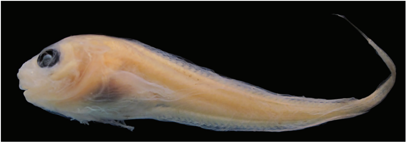
Fig. 1. Careproctus canusocius , new species, holotype, UAM 47901, 81.0 mm SL, Beaufort Sea, U.S.–Canada Transboundary waters, photographed after preservation.

Description. —Body slender, tapering posteriorly to slender tail, moderately compressed, depth at dorsal-fin origin 77.7 (72.8) % HL. Head moderately large, moderately depressed, slightly swollen nape, dorsal profile gradually sloping from nape to snout. Snout rounded, projecting beyond upper jaw. Mouth inferior, moderate in size, maxilla 52.6 (42.6) % HL,